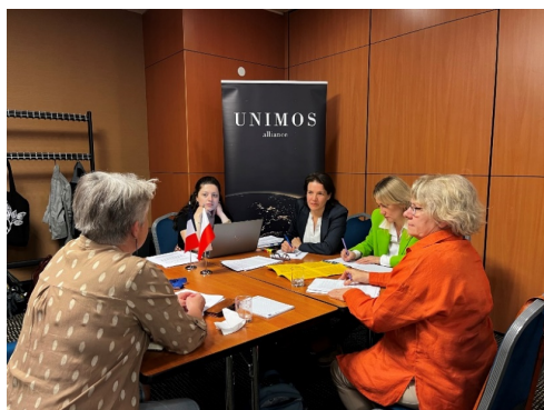
Picture 1: Discussion about the potential social innovations with the regional stakeholders.