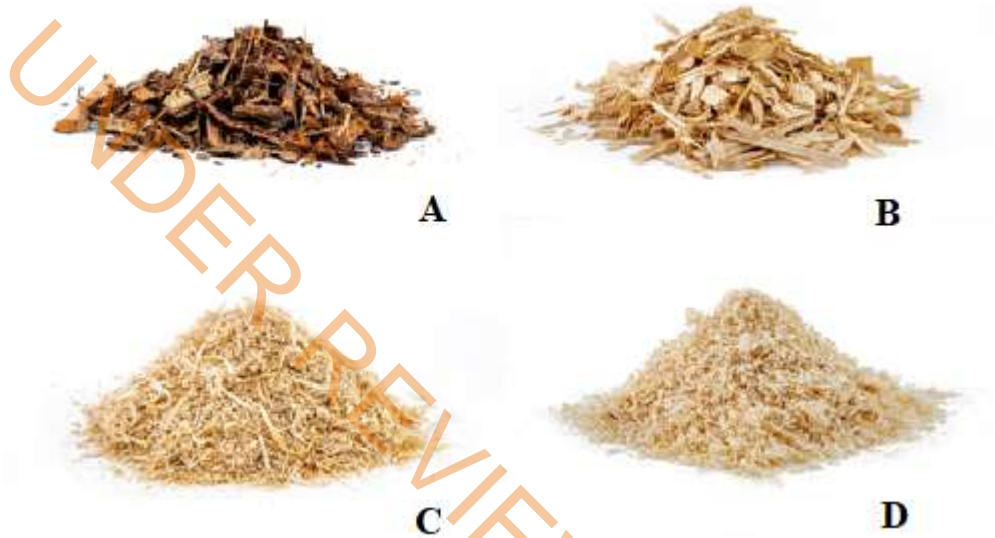
Figure 2. Picture of assortments, A = Bark, B = C-Chips, C = Sawdust and D = Shavings (Persson, L 1 )

been important to determine the conversion rates between ton, m 3 sub, MWh for the different assortments (Table 1).